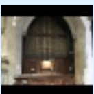
Frontal view (PRM)